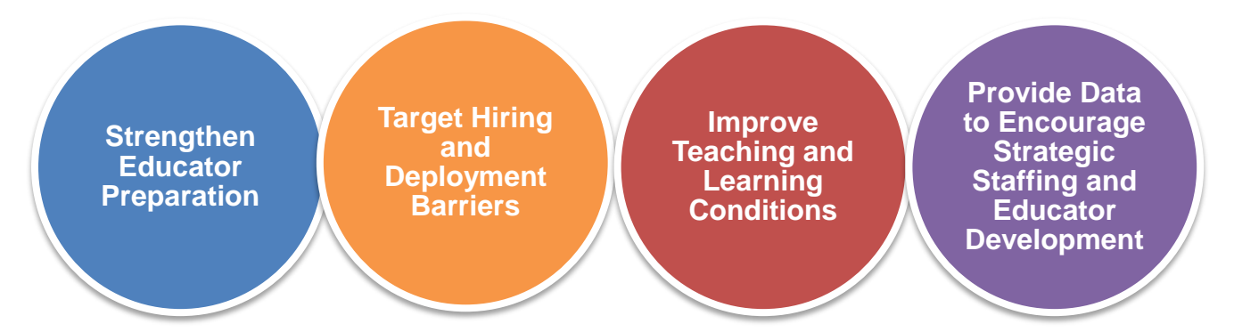
FIGURE 3. FOUR STRATEGIES FOR ELIMINATING IDENTIFIED EDUCATOR EQUITY GAPS

This strategy section of Ohio's Educator Equity Plan is organized around four strategies to eliminate identified educator equity gaps. These four strategies meet one or more of the following criteria: