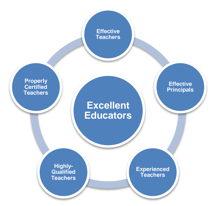
FIGURE 1. FIVE MEASURES FOR OHIO'S EDUCATOR EQUITY PLAN

All students deserve to have excellent educators teaching and leading their schools. This equity plan delineates an excellent educator using the five measures illustrated in Figure 1. As identified in section two, the plan outlines Ohio's educator equity gaps based upon these measures. To address these equity gaps, Ohio must first understand why these gaps exist in our high-poverty and high-minority schools.